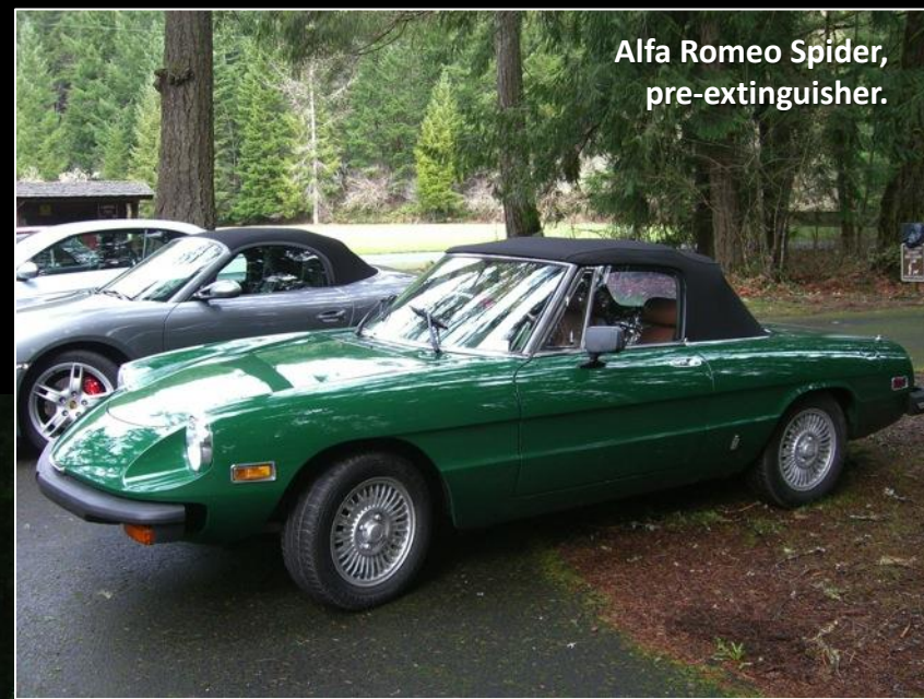
Alfa Romeo Spider, pre-extinguisher.