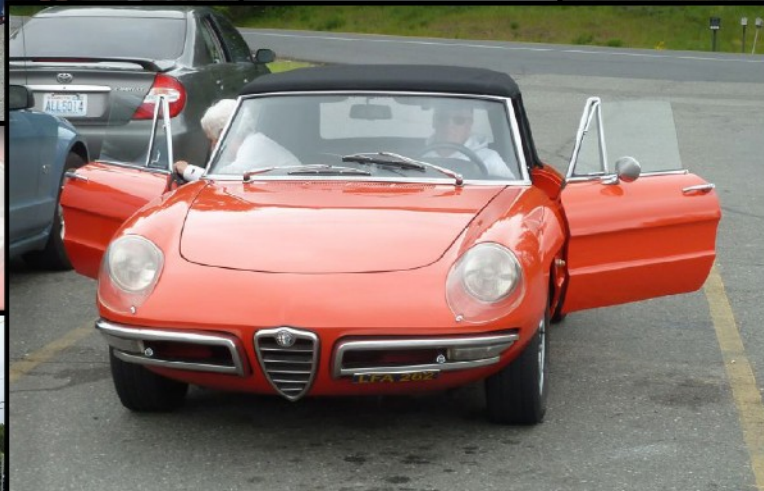
AROO – NWARC Joint Tour