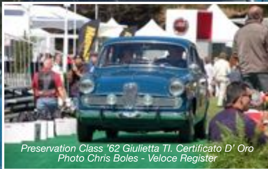
Preservation Class '62 Giulietta TI. Certificato D' Oro