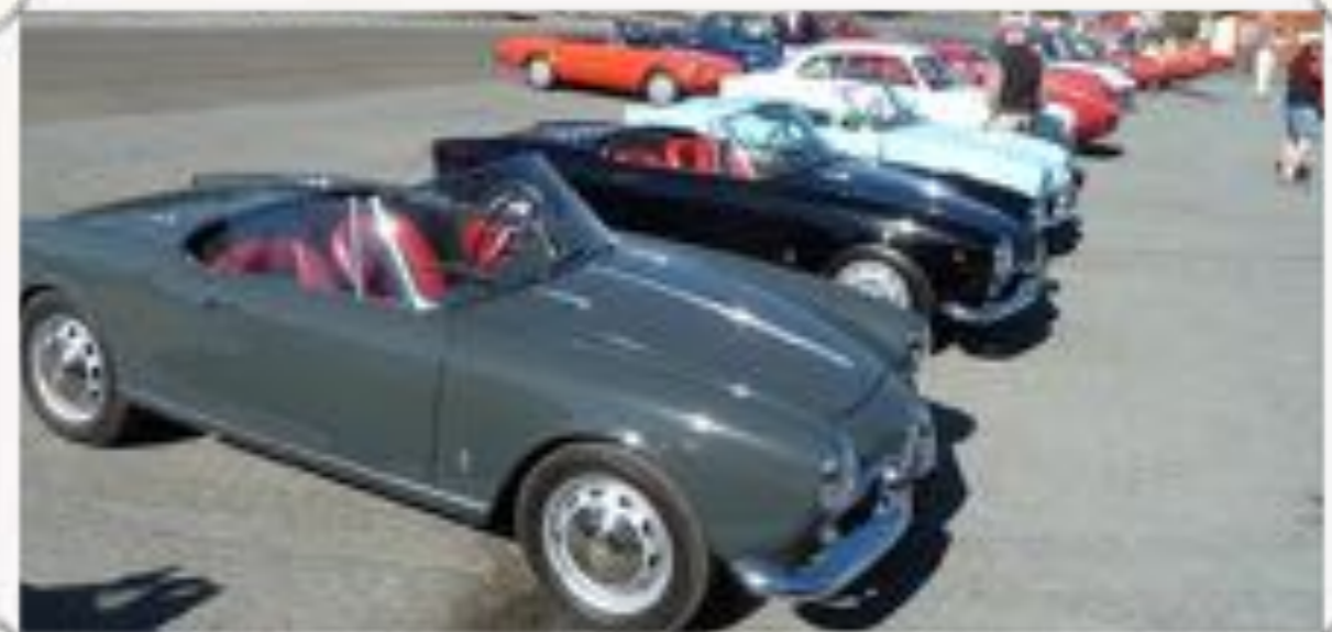
Old Spider Tour.