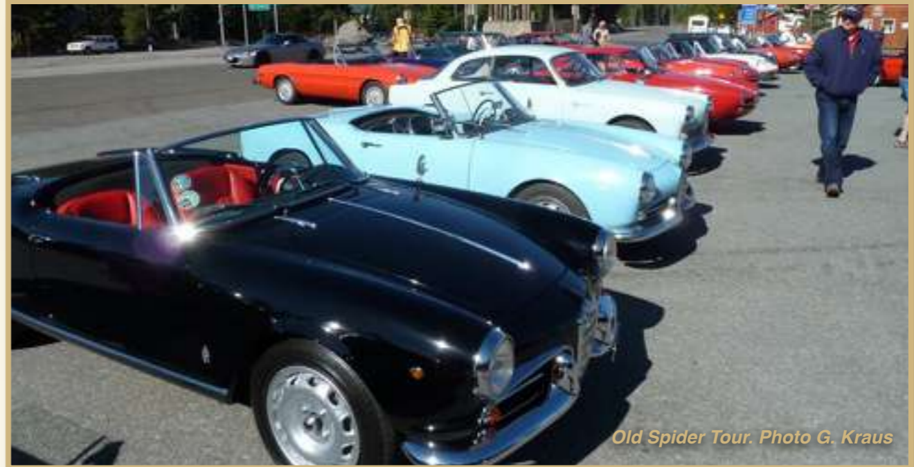
Old Spider Tour.

To see some vidios of past AROO track events. CLICK HERE!