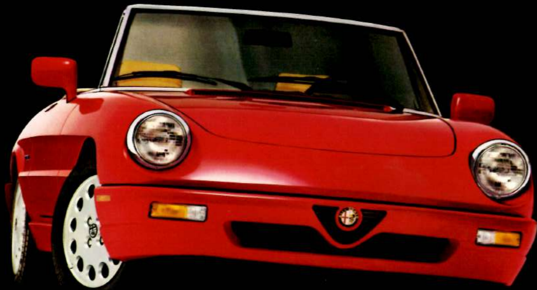
Alfa Romeo Spider Veloce

"Few cars are as much fun to drive (as the Spider). Quality workmanship throughout. Not inexpensive, but a lot of car for the money."