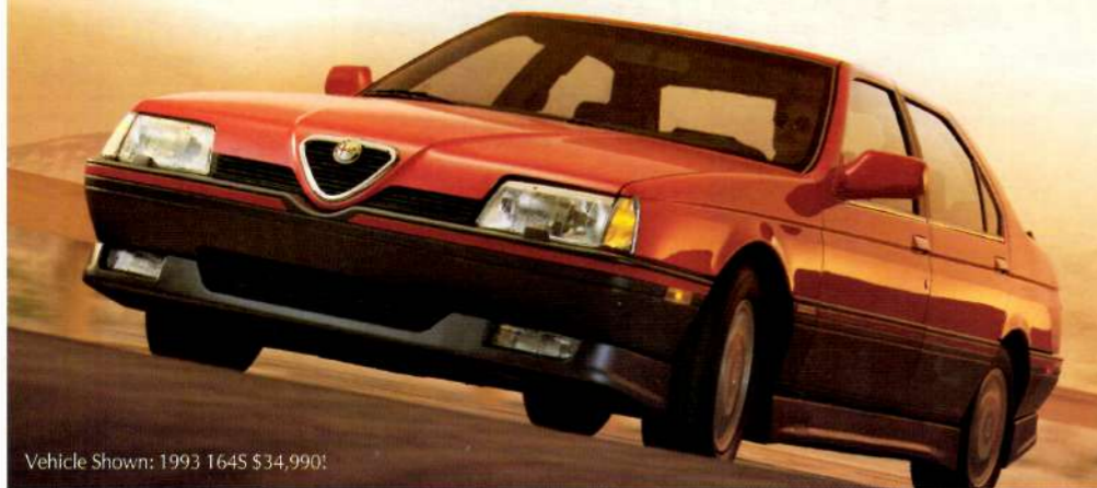
Vehicle Shown: 1993 164S $34,990!

The legendary marque of high performance.