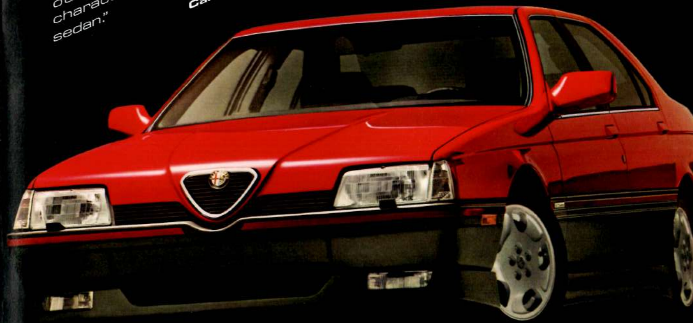
Alfa Romeo 164 S

"The new 164 thrills the driver with the same qualities and characteristics that enthusiasts have grown to love about Italian cars: their charisma, their charm, and their wonderful sounding engines."