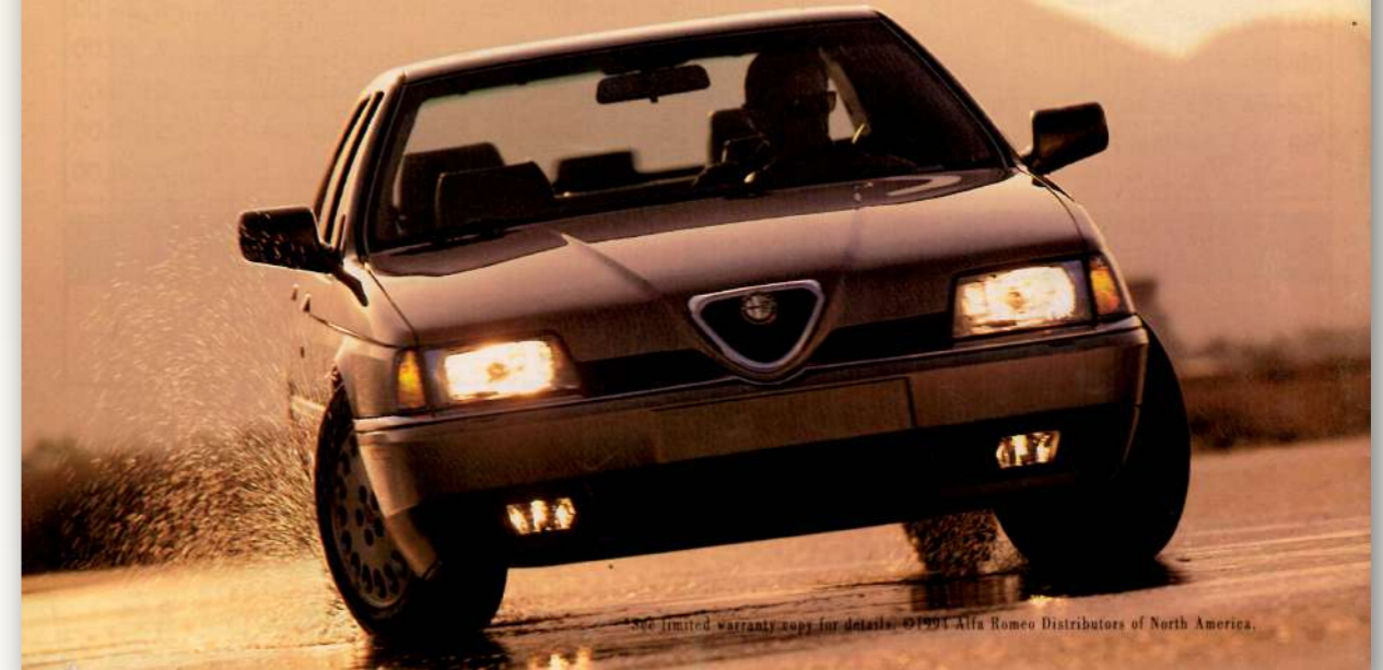
See limited warranty copy for details. ©1993 Alfa Romeo Distributors of North America.