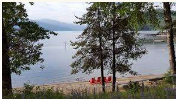
View from Elkins Resort

After lunch in Wallace, we are off to Priest Lake. The afternoon drive will take a little more than 3 hours over 194 miles. Our destination is Elkins Resort, located on the lake. We