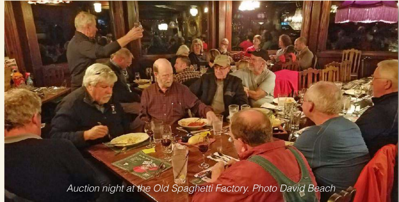
Auction night at the Old Spaghetti Factory.

To see some videos of past AROO track events. CLICK HERE!