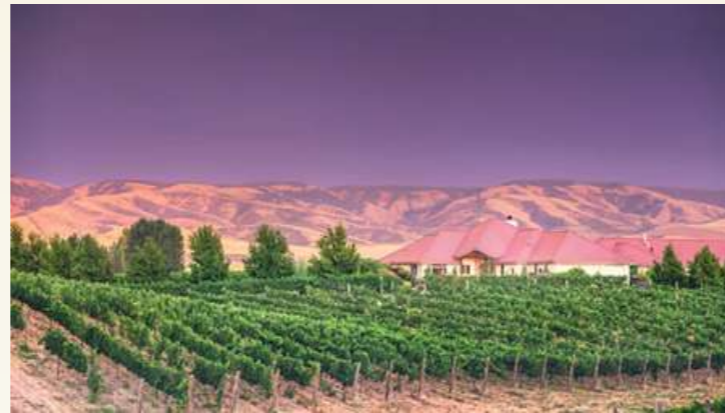
Walla Walla wine country

The 2018 Alfa Wannabe tour takes us to Northern Idaho. Being sensitive to some who felt the drive times each day were a little long last year, I have designed this tour with that in mind. What follows is a day by day outline of the tour.