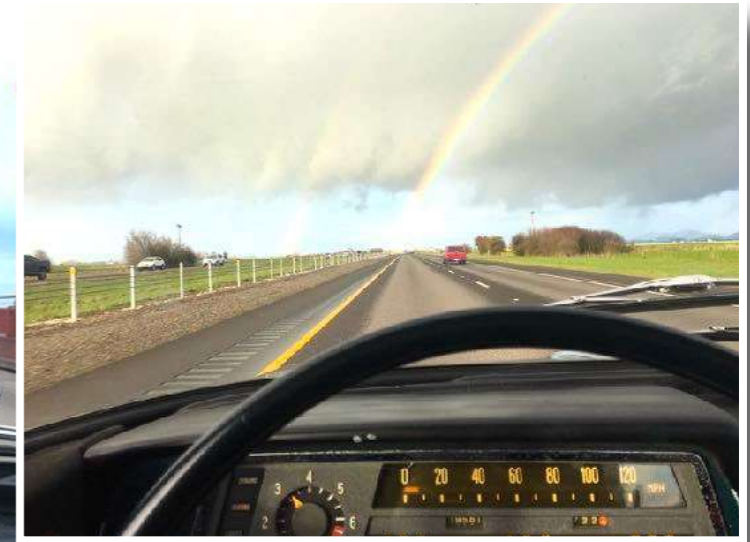
Tom Burnett's new ride