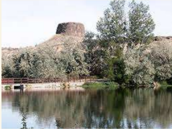
Hat Rock State Park

H ard to believe it is time to start thinking about the 2018 tour. I still have very fond memories of our 2017 trip to the Canadian Rockies, hot spring resorts and especially Prince of Wales Hotel in Alberta.