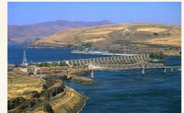
View from Ceillo Inn

This will be the one long day of driving. We will cover around 340 miles over 6 plus hours. Destination is Ceillo Inn, a nice place overlooking the Columbia River and Bonneville Dam. After happy hour on the deck, we will head into town for a 'farewell dinner.'