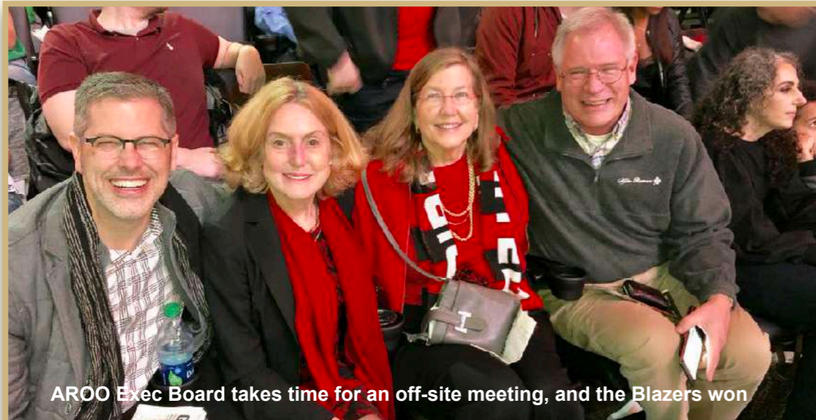
AROO Exec Board takes time for an off-site meeting, and the Blazers won