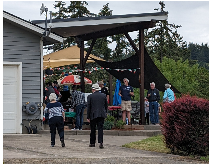
Bottom - three happy Fiats got their chance on the lawn as well. The picnic area was decorated in festive banners and an Alfa umbrella that had to go back to the late 80's... and it doesn't leak!