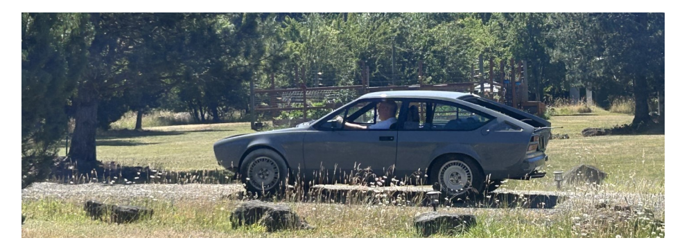
The 76 Alfetta GT - spotted in the wild, under it's own power - first time in three years!

And... mark your calendars NOW for September 21! AROO will be driving down to Eugene to tour the Haugland collection! It's also our celebration of the Alfetta's 50th Anniversary, so bring your transaxle car to the party! More info later in this issue also. This is one not to miss!