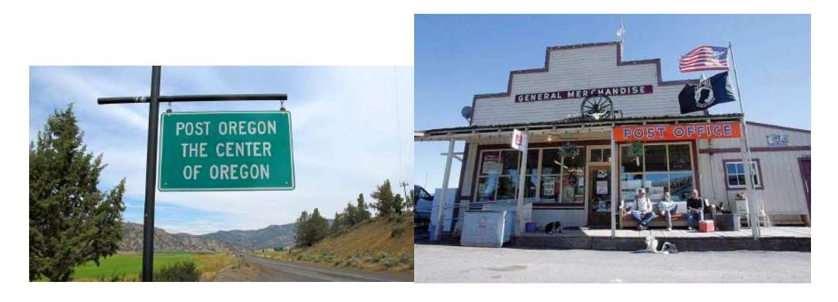
A first for me! What about you?