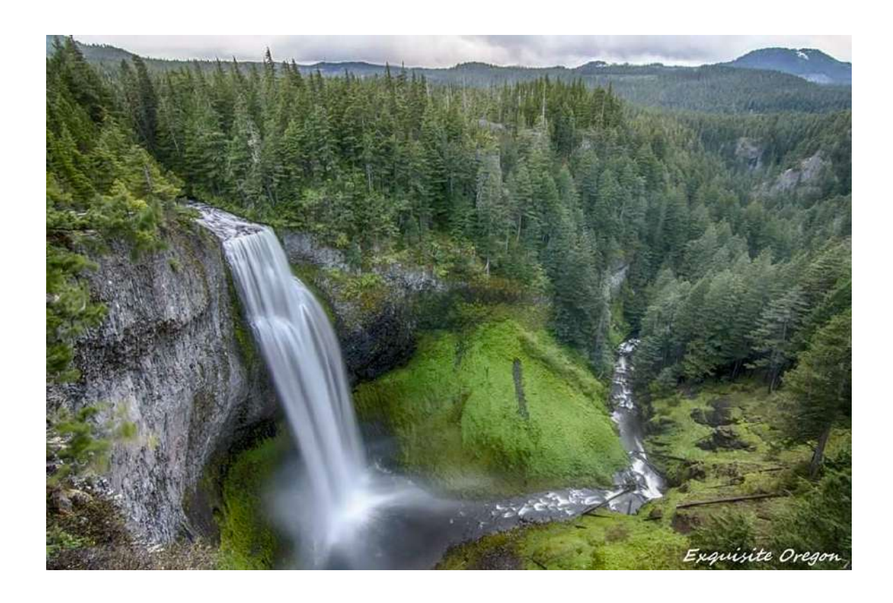
I 'discovered' this place planning a tour several years ago. I will not tell you how many times I had blown by.

RESERVATIONS: ASK FOR ALFA ROMEO ROOM BLOCK RATES!