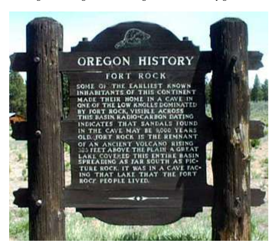
A lot of history here