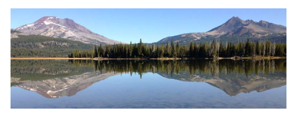
Just one of many serene views from this highway.