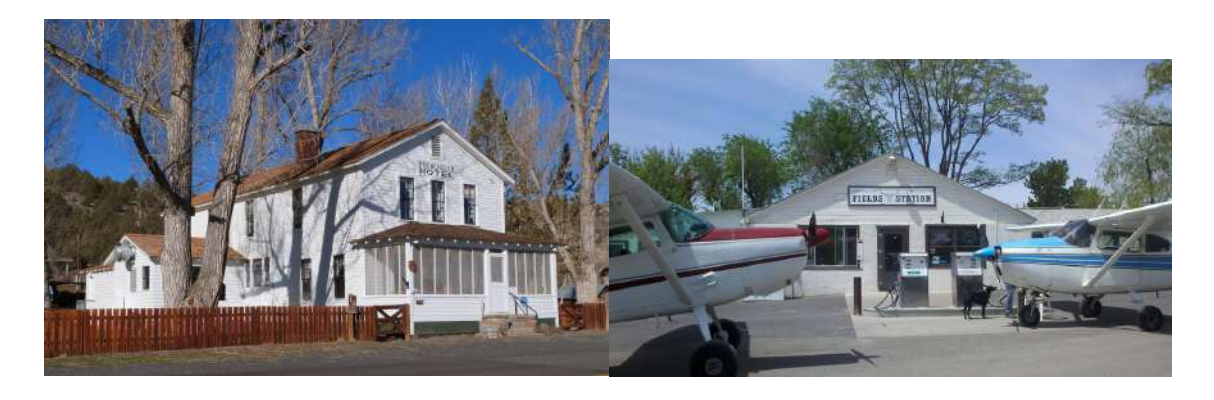
Imagine the stagecoach arriving.