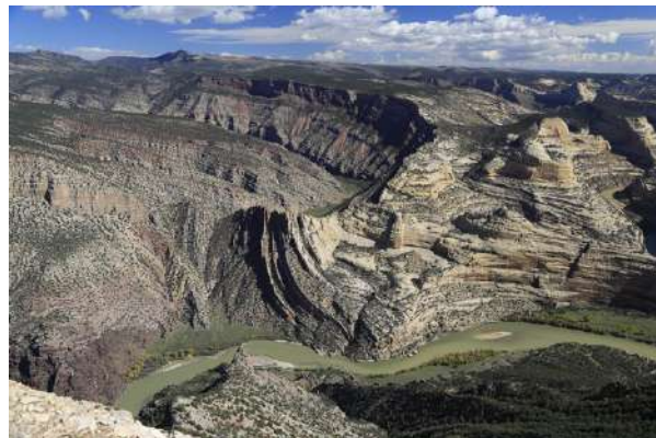
Dinosaur National Monument

Day Five: The National Dinosaur National Monument features over 1500 fossils, many of them embedded in a huge indoor wall at the Quarry Exhibit. After a scenic drive through the eastern