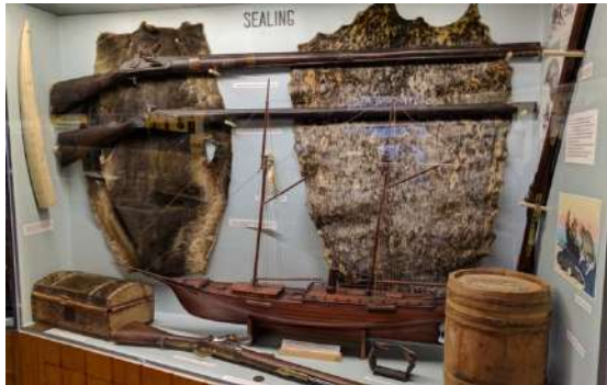
Museum of the Fur Trade

Day Eight: Two major highlights today. Museum of the Fur Trade contains over 6000 items boasting to be the largest exhibit dedicated to the fur trade in the country. The museum also covers period native Indian culture. A club member who has visited here said it was “not to be missed.” Thereafter, we drive through Badlands National Park on yet another national scenic highway. This place is one of the most rugged and staggeringly beautiful places you will ever see. We end our day in Wall, SD.