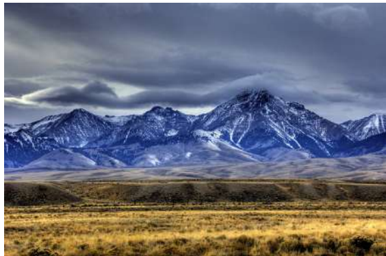
Big Horn Mountains