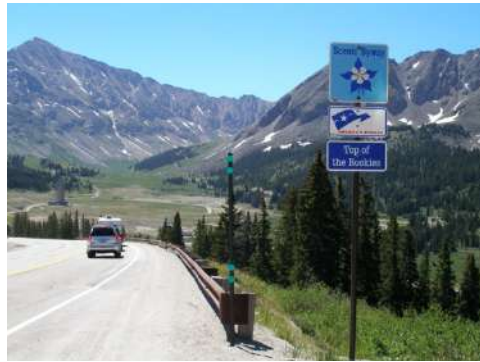
Top of the Rockies Scenic Hwy

Day Six: We drive one of the most scenic drives in the country. Top of the Rockies Scenic Hwy reaches a staggering 12,095 feet and is surrounded by multiple mountains over 13,000 feet! After lunch in Aspen, we drive another portion of the highway as head to Winter Park. We will cross three separate continental divides today!