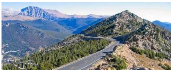
Rocky Mtn NP