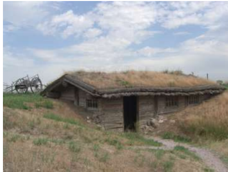
Fur Trader Cabin at Museum Site

Day Nine: Mt Rushmore and the famed Needles Scenic Highway will be the highlights today. Needles Highway passes through the granite Black Hills of SD. In addition to a lot of great views, the 14 mile highway features “360 curves, 32 switchbacks, unmarked cliff hangings, kiddie sized lanes, three tiny tunnels and much more.”