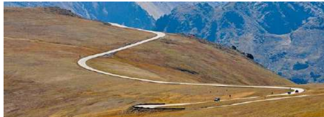
Trail Ridge Road-Rocky Mtn NP