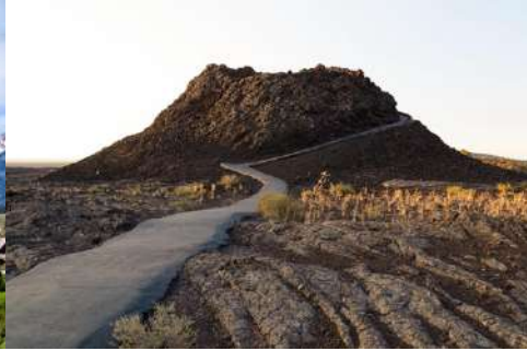
Craters of the Moon

Day Three: Stanley to Pocatello Idaho including Crater Of the Moon National Park and a stop at the Shoshone Bannock Tribal Museum.