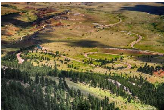
Big Horn Highway-Hold On!