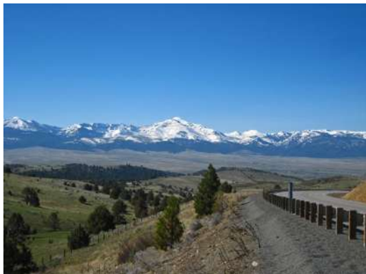
Blue Mountains East of Baker

Day One: Salem to Baker City (Grand Geiser Hotel) via John Day/Painted Hills.