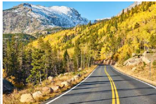
Rocky Mtn NP