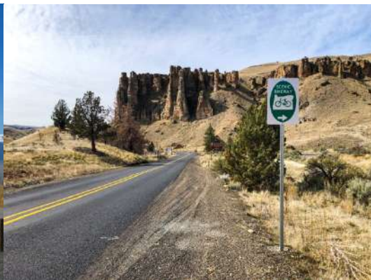
Cathedral Rocks/Painted Hills

Day Two: Great roads from Baker City thru the Wallowa Mountains to Stanley Idaho and the spectacular Sawtooth Mountains. We will stay alongside the Salmon River.