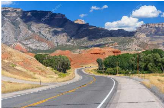
Big Horn Scenic Byway

Day Ten: Big Horn Battlefield, Custer's Battlefield Museum, the Bighorn Scenic Highway through Shell Canyon including a stop at Shell Falls and hopefully, dinner at Lisa's in Greybull are on today's itinerary. Shell Canyon cuts through three distinct rock layers ranging back 500 million years! The area was once part of the ocean hence the vast number of shells found over the years. Lisa's? Paula and I have made this restaurant a destination whenever we are anywhere nearby...best steaks ever and observing the local cowboys and cowgirls in full costume is a real hoot!