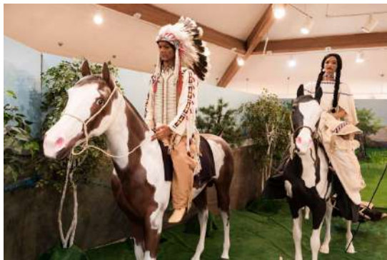
Shoshone Bannock Museum

Day Three: Stanley to Pocatello Idaho including Crater Of the Moon National Park and a stop at the Shoshone Bannock Tribal Museum.