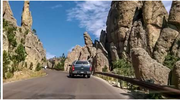
More Needles Highway

Day Ten: Big Horn Battlefield, Custer's Battlefield Museum, the Bighorn Scenic Highway through Shell Canyon including a stop at Shell Falls and hopefully, dinner at Lisa's in Greybull are on today's itinerary. Shell Canyon cuts through three distinct rock layers ranging back 500 million years! The area was once part of the ocean hence the vast number of shells found over the years. Lisa's? Paula and I have made this restaurant a destination whenever we are anywhere nearby...best steaks ever and observing the local cowboys and cowgirls in full costume is a real hoot!