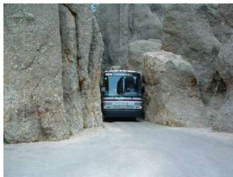
One of Needles Hwy Tunnels