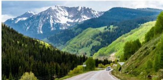
Top of the Rockies Scenic Hwy

Day Six: We drive one of the most scenic drives in the country. Top of the Rockies Scenic Hwy reaches a staggering 12,095 feet and is surrounded by multiple mountains over 13,000 feet! After lunch in Aspen, we drive another portion of the highway as head to Winter Park. We will cross three separate continental divides today!