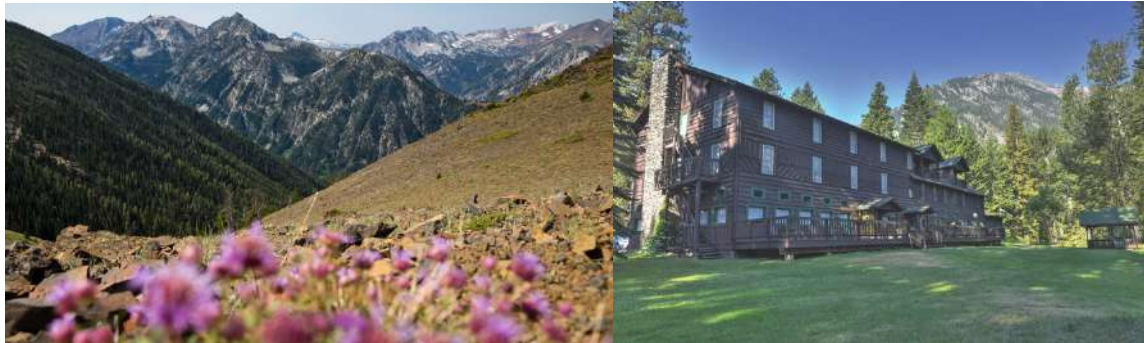
Wallowa Mountains and Lodge

The afternoon drive will take us to the Big Hole Battlefield National Monument where the Nez Perce took on the 7 th Cavalry in a failed attempt to escape to Canada.